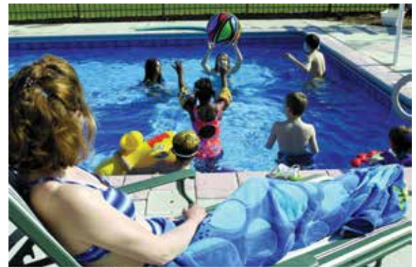
Underwriters Laboratories Inc.